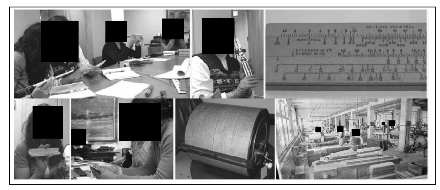
Figure by MIT OpenCourseWare.