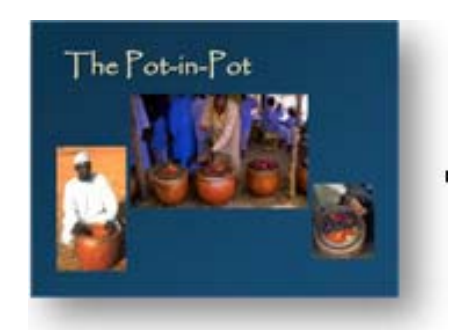
Photos © Rolex Awards for Enterprise. All rights reserved. This content is excluded from our Creative Commons license. For more information, see <a href="http://ocw.mit.edu/fairuse">http://ocw.mit.edu/fairuse</a>.

Another commonly cited example of appropriate technology is the pot-in-pot evaporative cooler. It works by having a pot within a pot, separated by a layer of dirt that can be moistened, so the interior is cooled as the water evaporates. In these pots, vegetables can last 2-3 weeks without refrigeration instead of just a few days, enabling households to store food longer. The coolers also enable farmers to wield more negotiating power and command better prices in the market by helping to reduce the pressure to sell before the vegetables go bad. Local potters can be trained to make these "desert refrigerators," but the key word is "desert" because this technique works much better in areas of low humidity. The pot-in-pot coolers do not work as well during the wet season or in certain climates, and can be difficult to transport. In Nigeria, a teacher from a family of potters