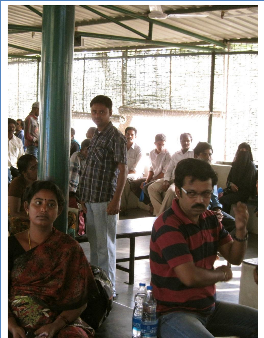
Non-paying patients have a separate waiting area.

LV Prasad Eye Institute (LVPEI) is an eye care hospital in Hyderabad, India, that has served over 15 million people, 50% of its patients at free of cost. Its mission is to provide equitable and efficient eye care to all sections of the society. The hospital naturally faces large patient volumes and is concerned that its capacity constraint is creating long wait time for its patients. Opportunity exists in capturing dynamic changes in patient demand and patient pathway to expose the bottlenecks and inefficiencies in the system that is creating long patient wait time.