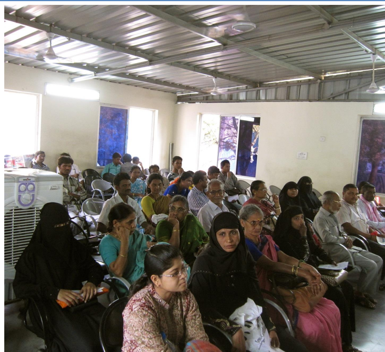
Patients wait at the walk-in counter for hours everyday to see a doctor at LVPEI.