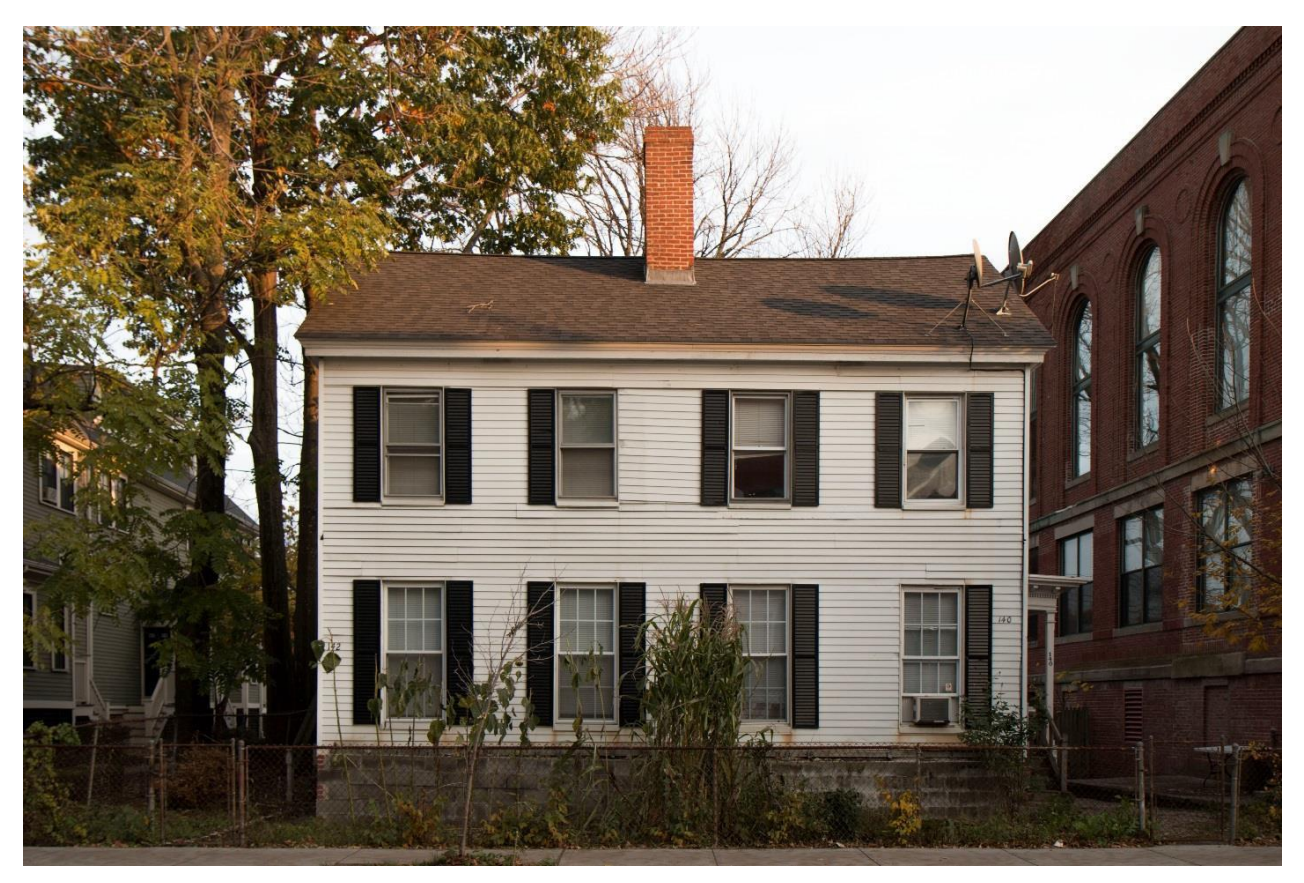
142 Prospect Street – Note simplicity in windows and form, central fire place location. (Note this is in the style but does not mean it was actually built later).

From 1793, the first batch of surviving houses were erected after the West Boston Bridge opened. The style is relatively simple with minimal ornamentation. The façade is a single surface; even a wood structure appears like a solid piece of stone. Large chimneys generally hold the house together spatially as a center hearth.