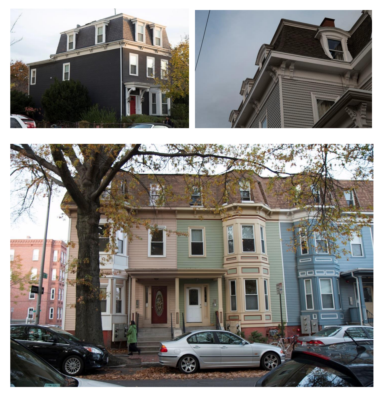
Clockwise from top left: 97 Prospect St, 156 Norfolk St, 210 Harvard St

This style, characterized by the mansard roof among other elements, was popular in France in the middle of the nineteenth century, and the style was later imported in the United States. The roof, also known as a hip roof, has a steep pitch, quite different from an ordinary pitched roof.