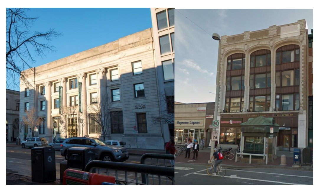
689 Massachusetts Avenue; 614 Massachusetts Avenue

Twentieth Century Commercial Architecture (1900- ca. 1950)