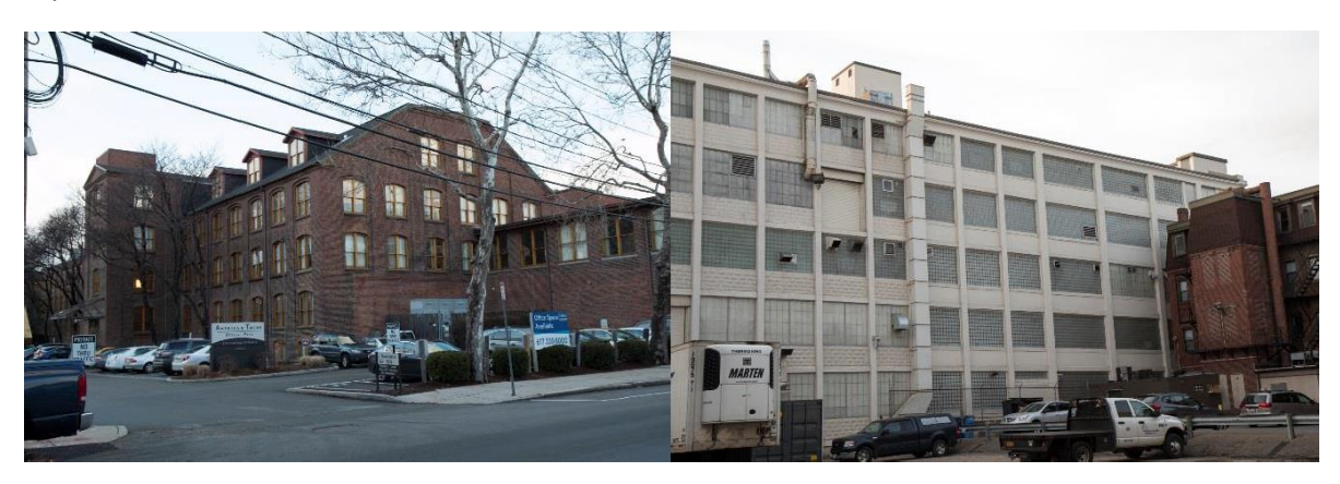
American Twine Building; Cambridge Brands Inc.

The key difference from industrial buildings and commercial buildings is ornamentation, scale, and repetition of elements.